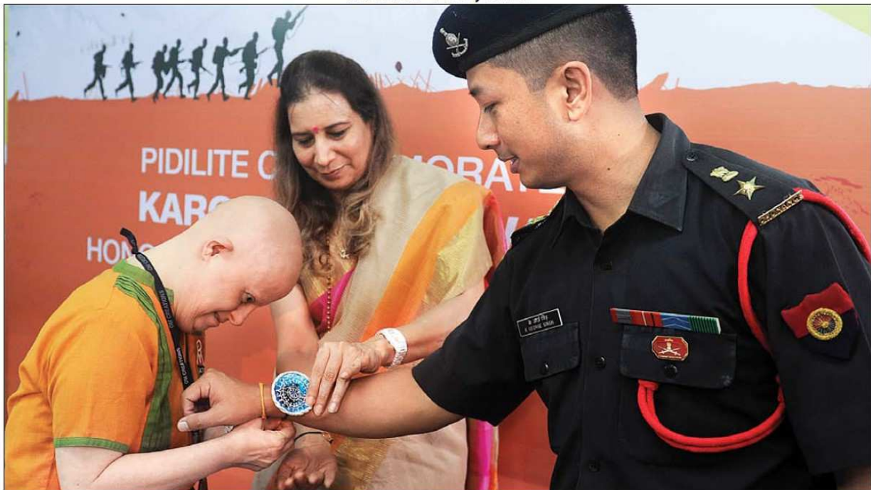
A specially abled kid ties a rakhi on the wrist of an Indian Army officer to celebrate Kargil Vijay Diwas at an event at King George V Memorial Infirmary in Mahalaxmi on Tuesday. Over 1 lakh rakhis made by students from across the country will be sent to the Indian Army