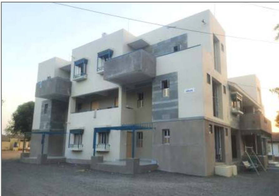
Picture 2: Construction of hostel facilities with the support of Pidilite

These guidelines from the Gujarat Private Universities Act, 2009 outline the steps and financial commitments required to establish a private university in Gujarat.